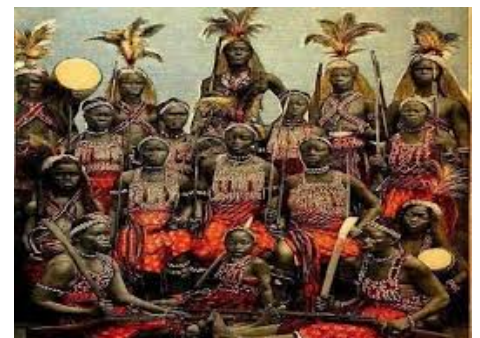
Dahomey Amazon Warriors