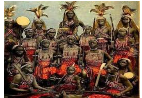
Dahomey Amazon Warriors