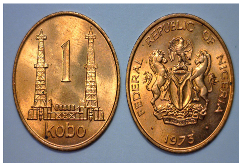
Kobo (Nigerian Currency)