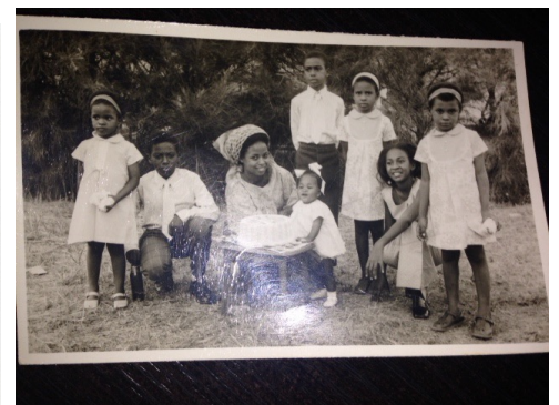
Personal Image (Strong women in my life)